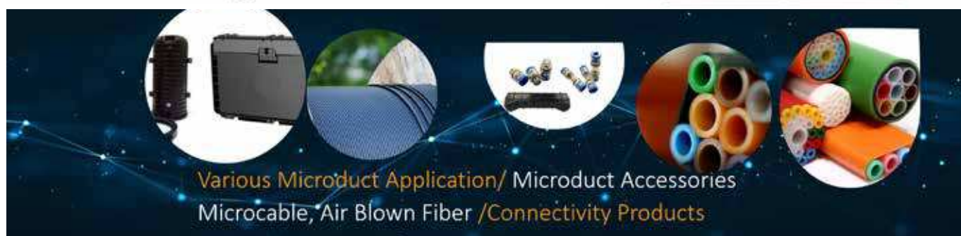
Various Microduct Application/ Microduct Accessories Microcable, Air Blown Fiber /Connectivity Products